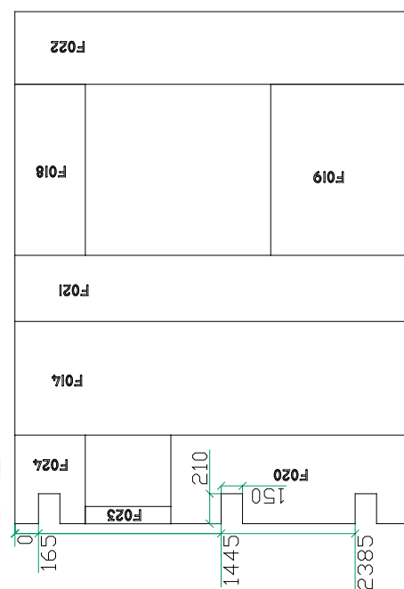
Oplastenie /pohľad A/