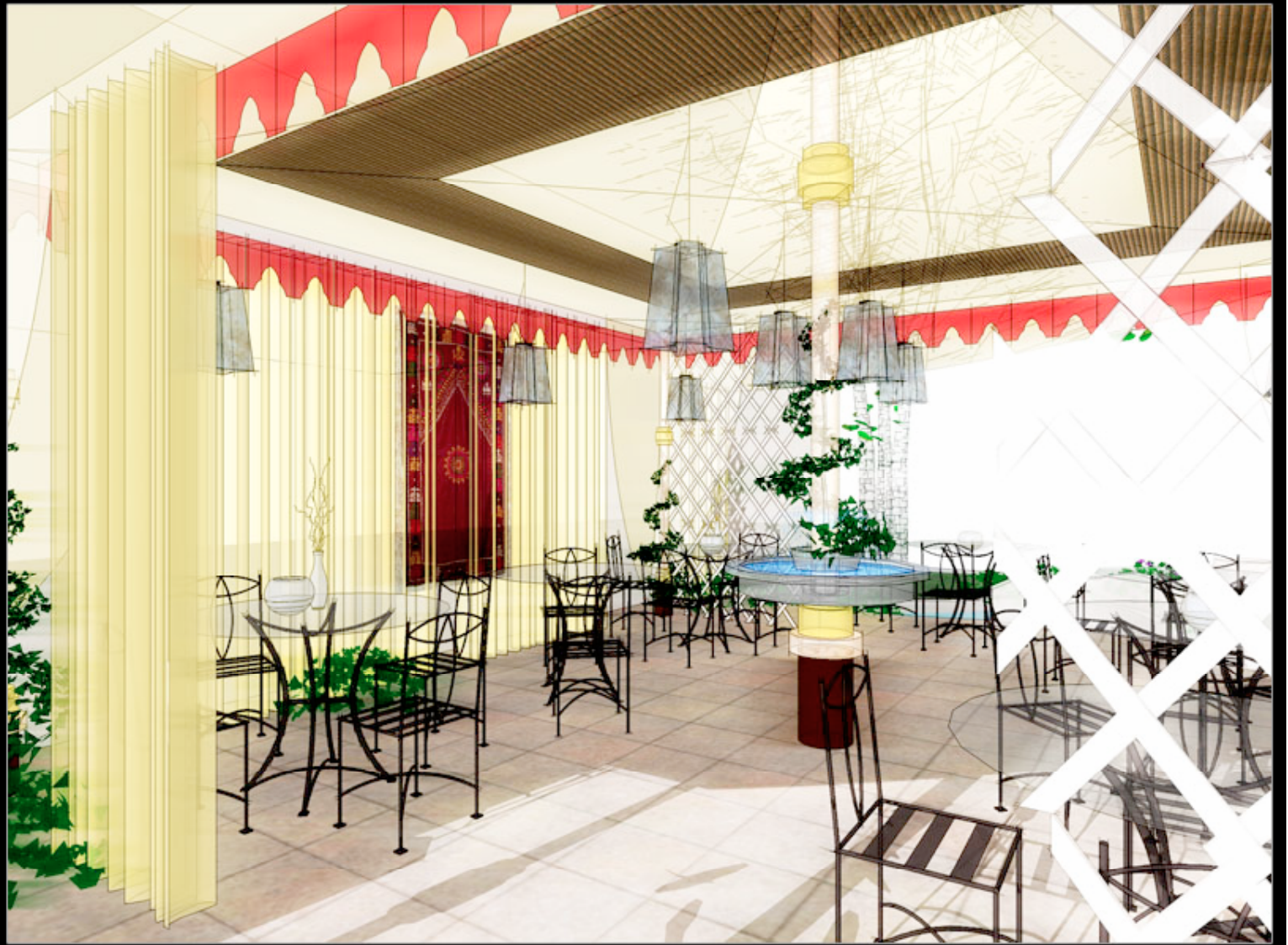
Interior using technique