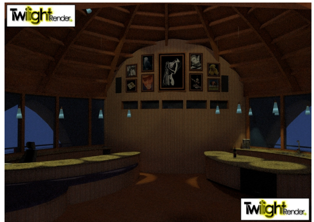
Twilight – 15.6 Min