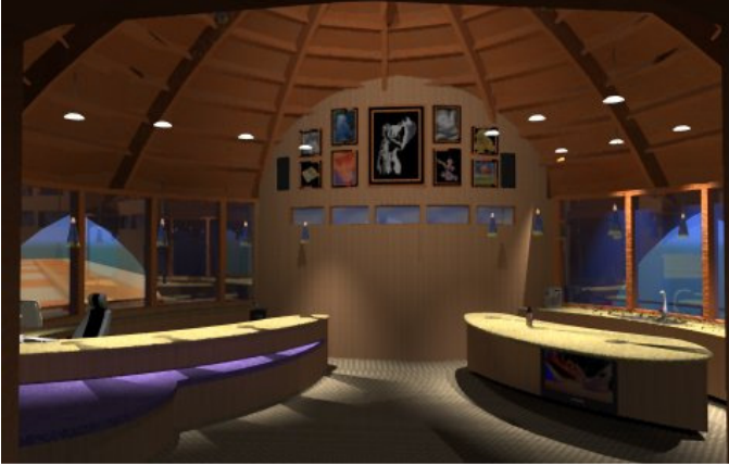
IDX Renditioner – 10.15 Min