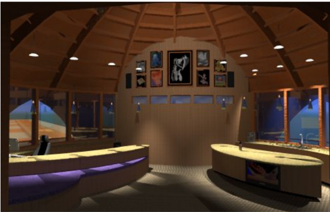
IDX Renditioner - 6.75 Min