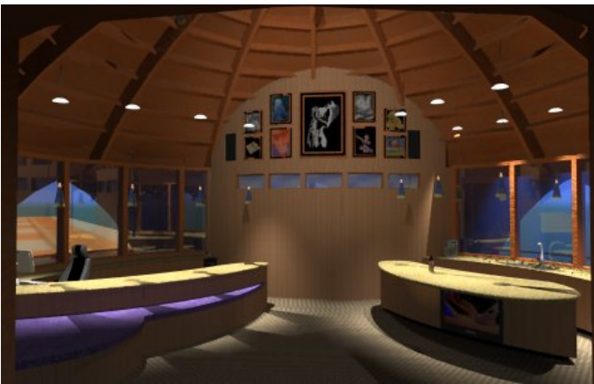
IDX Renditioner – 14.9 Min