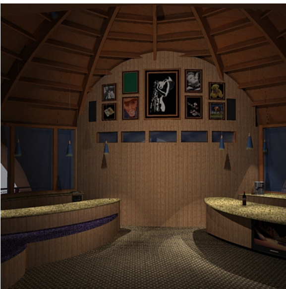
Podium – 8 Min