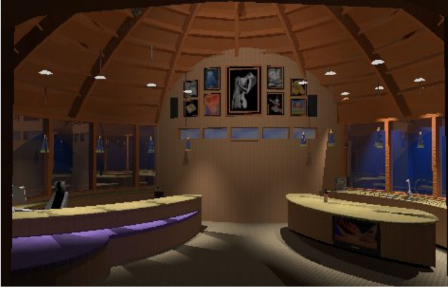
IDX Renditioner 1.7 Min