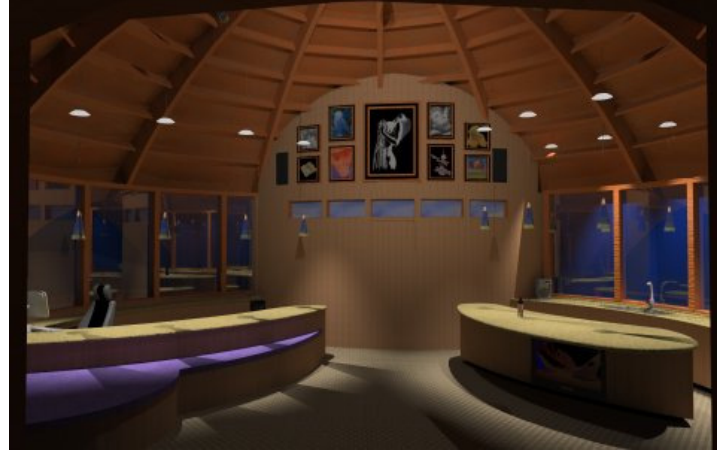
IDX Renditioner - 1.6 Hrs