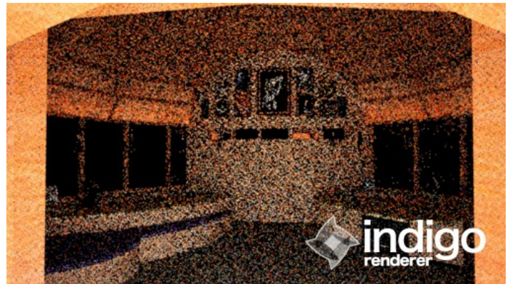
Indigo – 5 Min