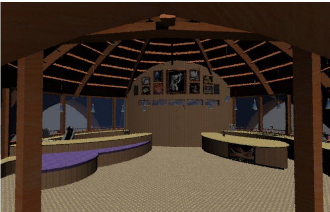
Shader light – 3 Hrs