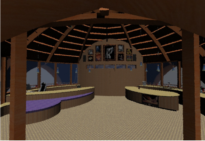
Shader Light - 1 Hr